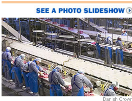
Workers prepare pigs' meat for export to Japan and U.S. at Danish Crown's new, energy efficient slaughterhouse.